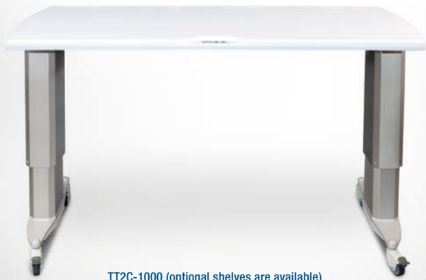
TT2C-1000 (optional shelves are available)