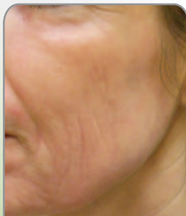
8 WEEKS POST TX