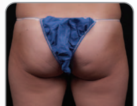
4 WEEKS POST 2 TX