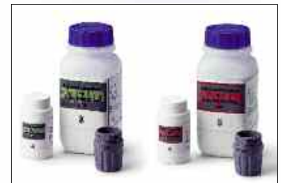
You can choose between 2 corundum powders of either 50 µm grain or 27 µm - colour-coded for clear identification.