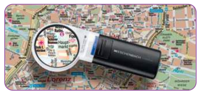
Mobilux Magnifier from Eschenbach

What practitioners consider to be low vision is characterized simply by a patient experiencing partial sight. This can be in the form of a scotoma, an attenuated visual field, or blurred vision, and is usually caused by several different eye conditions or degenerative eye disease. In the region, these conditions often have a foundation in genetic disorders.