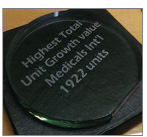
STAAR Unit Growth Value Award