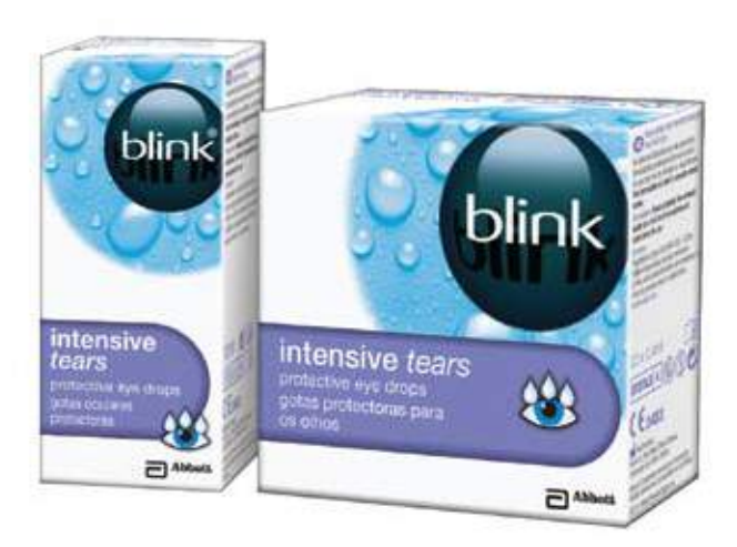
Blink intensive tears unidose & multidose

Discussing dry eye solutions leads us to talk about one of the best lubricant treatments available in the market: Blink intensive tears. It has a high viscosity due to the presence of the famous active ingredient, Hyaluronic Acid at 0.2%, helping in having a great residence time in the cornea. Also, the presence of the Polyethylene Glycol (PEG) gives this unique product high wetting properties and therefore great lubrication. Adding to that, it is rich in nutrients due to the presence of the essential natural electrolytes of tears (Calcium, Sodium, Magnesium) leading to healthy eyes. Not to mention, Blink is a hypotonic solution that helps in counteracting the hyperosmolarity of tears in dry eye patients.