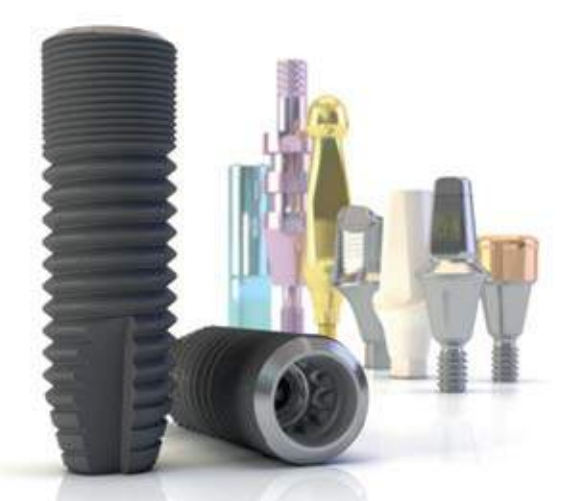
Astra Tech implants

for the patient. Thankfully we are finding ourselves accomplishing that status, with all our doctors and in all our departments, not only in dentistry. This is the promise that we at Medicals International, pledge to provide to those who seek this company that has evolved, due to the trust we instill, into an institution.