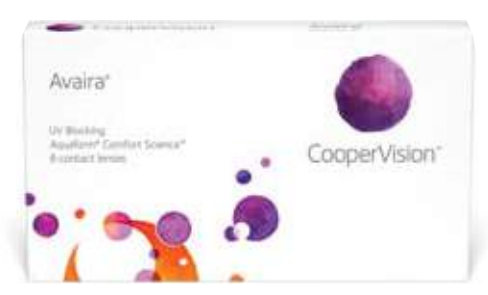
Avaira pack of 6

Another feature is low modulus. Modulus is the degree of contact lens flexibility, and the lower the modulus, the softer and more flexible the lens. AVAIRA has the lowest modulus of 0.50 Mpa with the highest water content of 46% and the best handling thanks to the lenticulation in its design.