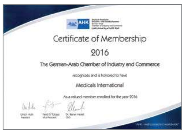
Certificate of Membership

For more than sixty years this organization has been promoting bilateral business relations between the Egypt, North Africa, the Middle East, and Germany. It is the largest in the framework of business cooperation between Germany and the Arab world representing more than 2,700 member companies.