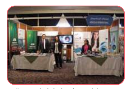
Syrian Ophthalmological Society