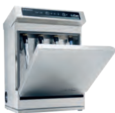
STATMATIC handpiece maintenance