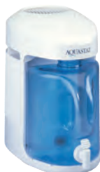
AQUASTAT water distiller