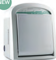
STATMATIC PLUS** handpiece cleaning and maintenance