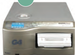
STAT/M 5000 G4 cassette autoclave