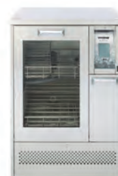
HYDR/M M2 washer/disinfector