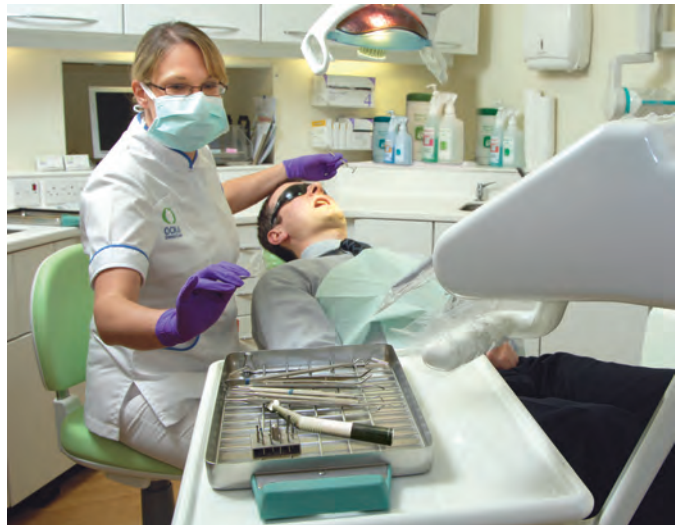
Point of care: A fresh set of sterilised instruments and handpieces for every patient.

It's a new formula! Speed equals money saved.