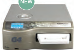
STAT/M 2000 G4 cassette autoclave