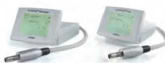
E-STAT/S* electric handpiece system