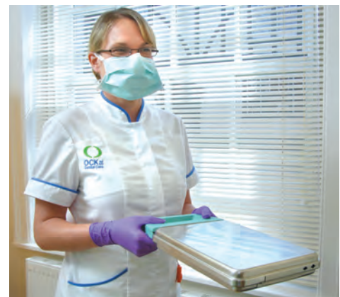
The STAT/M cassette provides a convenient aseptic method of transport for sterilised instruments.

STAT/M also documents its own successful cycle. A computerised microprocessor aborts the cycle if any of the parameters of temperature, pressure or time are not achieved. You can be certain that by following the simple keypad instructions the fully automatic operation will result in sterilisation of all your solid, hollow, wrapped or unwrapped instruments.