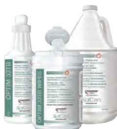
OPT/M 33TB surface cleaner and disinfectant