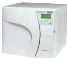
BRAVO fractionated vacuum steriliser Bravo17 (220-240V, 10A 50 Hz, Printer) Bravo17V (220-240V, 10A, 50Hz, Printer) Bravo21V (220-240V, 10A, 50Hz, Printer)