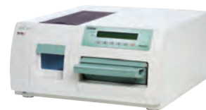
STAT/M 7000 cassette autoclave